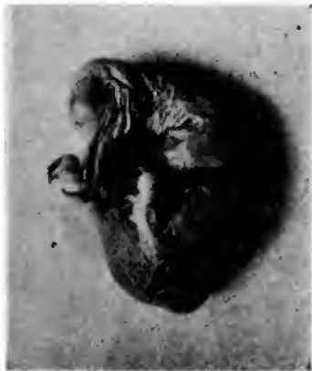
第五十二圖 アマツバメの雛 (實物大)